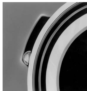
Simplified Anti-rotation device

An anti-rotation pin prevents rotation of the outer race within the housing. Simple and effective, it makes system inserts easier to replace. There is no need to remove and replace grease fittings, location pins or other devices.